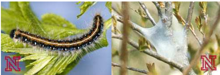
EASTERN TENT CATERPILLAR

The non-chemical Bt (Thuricide or Dipel) or insecticidal soaps must be sprayed directly on young caterpillars in the nests. Orthene, Sevin and Malathion should be applied as soon as the tents are noticed. Follow the directions carefully.