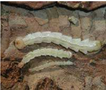
Above: Emerald Ash Borer Larvae

The state may pay for removal of infected ash trees if they qualify. For more information: http://www.agr.state.il.us/newsrels/r0308071.html . The Care of Trees on Ridgefield Road is a IDA certified marshalling yard.