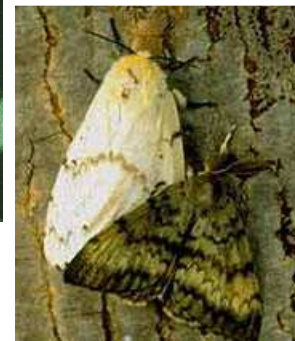
Above left: Gypsy Moth Larvae or caterpillars hatch in April or May Above right: Female and Male Gypsy Moths emerge from pupa in late July