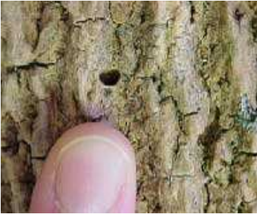
D-shaped exit hole in bark

“MOVEMENT OF INFESTED FIREWOOD AND WOOD PRODUCTS HAS REPEATEDLY BEEN FOUND TO BE THE MAJOR CAUSE OF INTRODUCTION OF EMERALD ASH BORER TO NEW GEOGRAPHIC AREAS.”