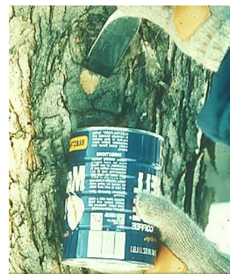
June through April, locate and scrape egg masses into water to drown or microwave to kill before disposing