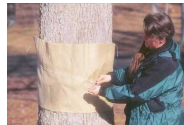
Tie around the middle of the burlap