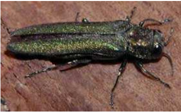
Adult Emerald Ash Borer