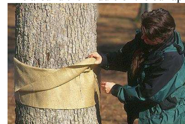
Fold top half over